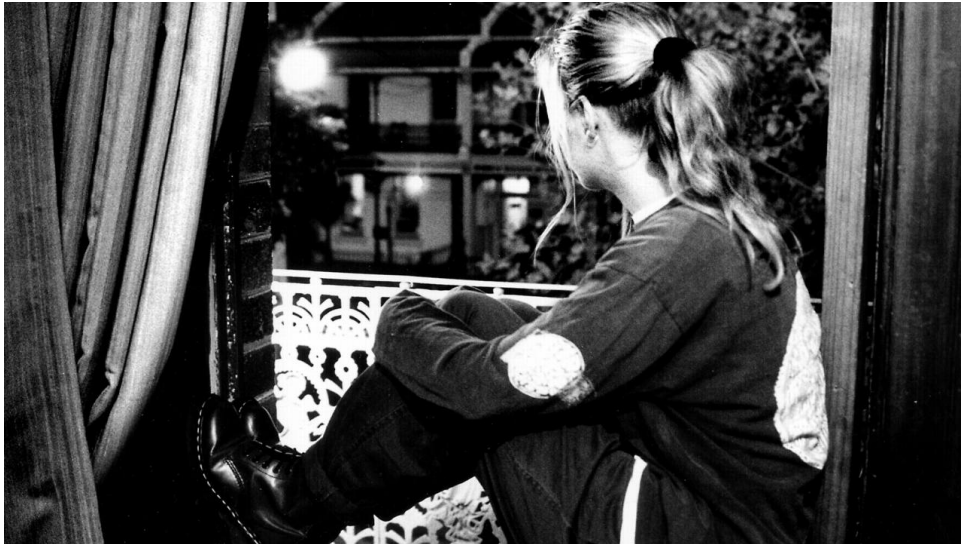
Anxiety is now the number one mental health diagnosis for young Victorians.

Announcing the infant and child hubs plan in the Sunday Herald Sun, Education and Mental Health Minister James Merlino said the specialist centres would provide mental health early intervention and support for little kids, with the aim of identifying and treating childhood developmental, behavioural and emotional issues.