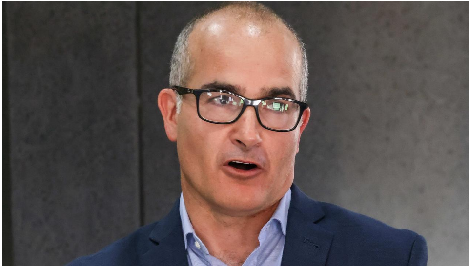
Victorian Education and Mental Health Minister James Merlino says the state has embarked on massive reforms.

The Murdoch Children’s Research Institute (MCRI) warned earlier this year the pandemic had taken “a significant toll” on adolescents’ mental wellbeing, academic results and physical health, adding the impacts would be more severe if action wasn’t taken to minimise harm.